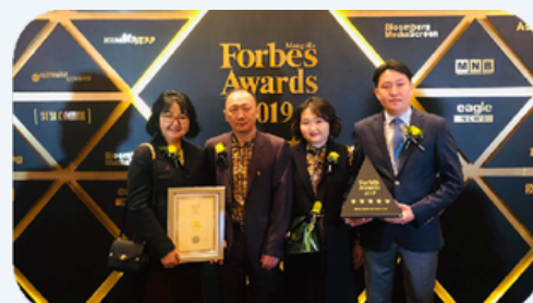
Excellence in Education, Forbes Awards 2019