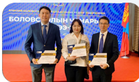
Top 20 School in Mongolia, Academic year 2021-2022