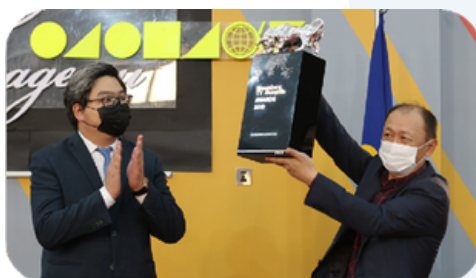
Management of the Year, BloombergTV Awards 2021