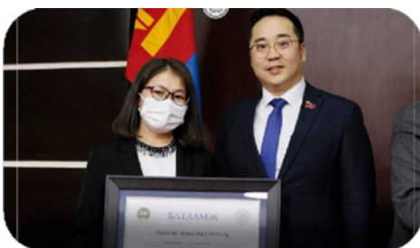
Best School of Bayanzurkh, Academic year 2021-2022