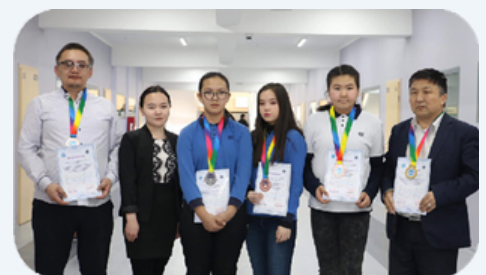
Best Mathematics School, Bayanzurkh district 2019