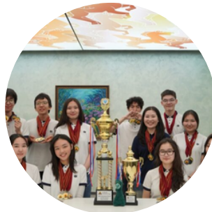
World Scholar's Cup 2025 - Jat Khor Award (Ulaanbaatar Round)