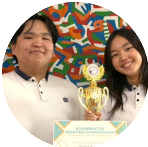
Ulaanbaatar Debating Championship 2025 - Grand Champions